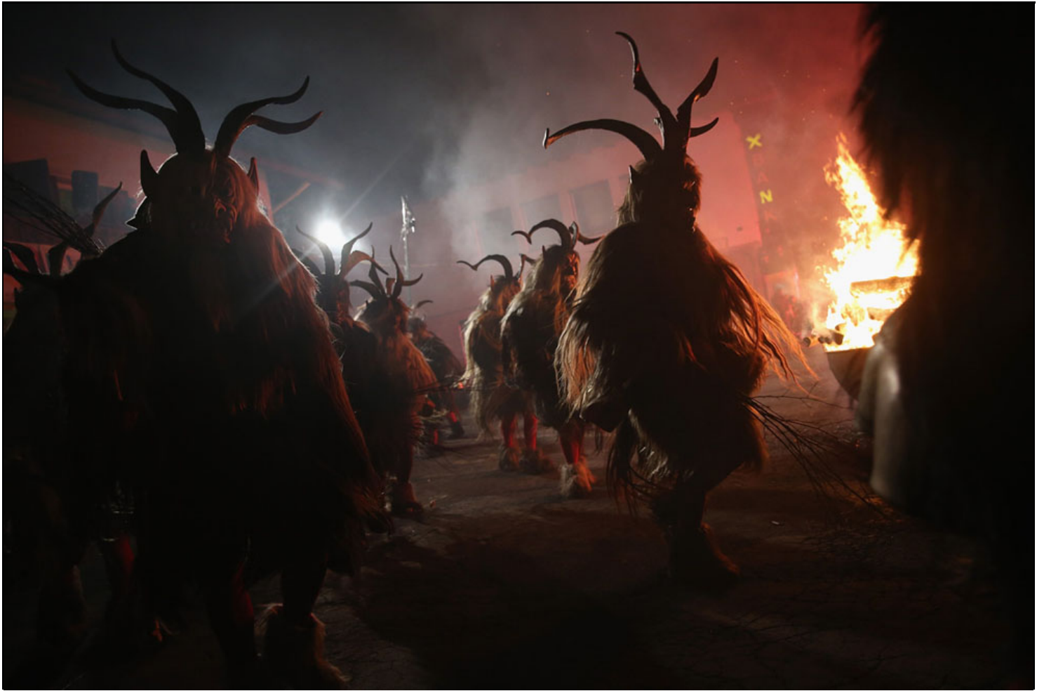
5 Members of the Haiminger Krampusgruppe parade on the town square during their annual Krampusnacht in Tyrol, on December 1, 2013. # 📸