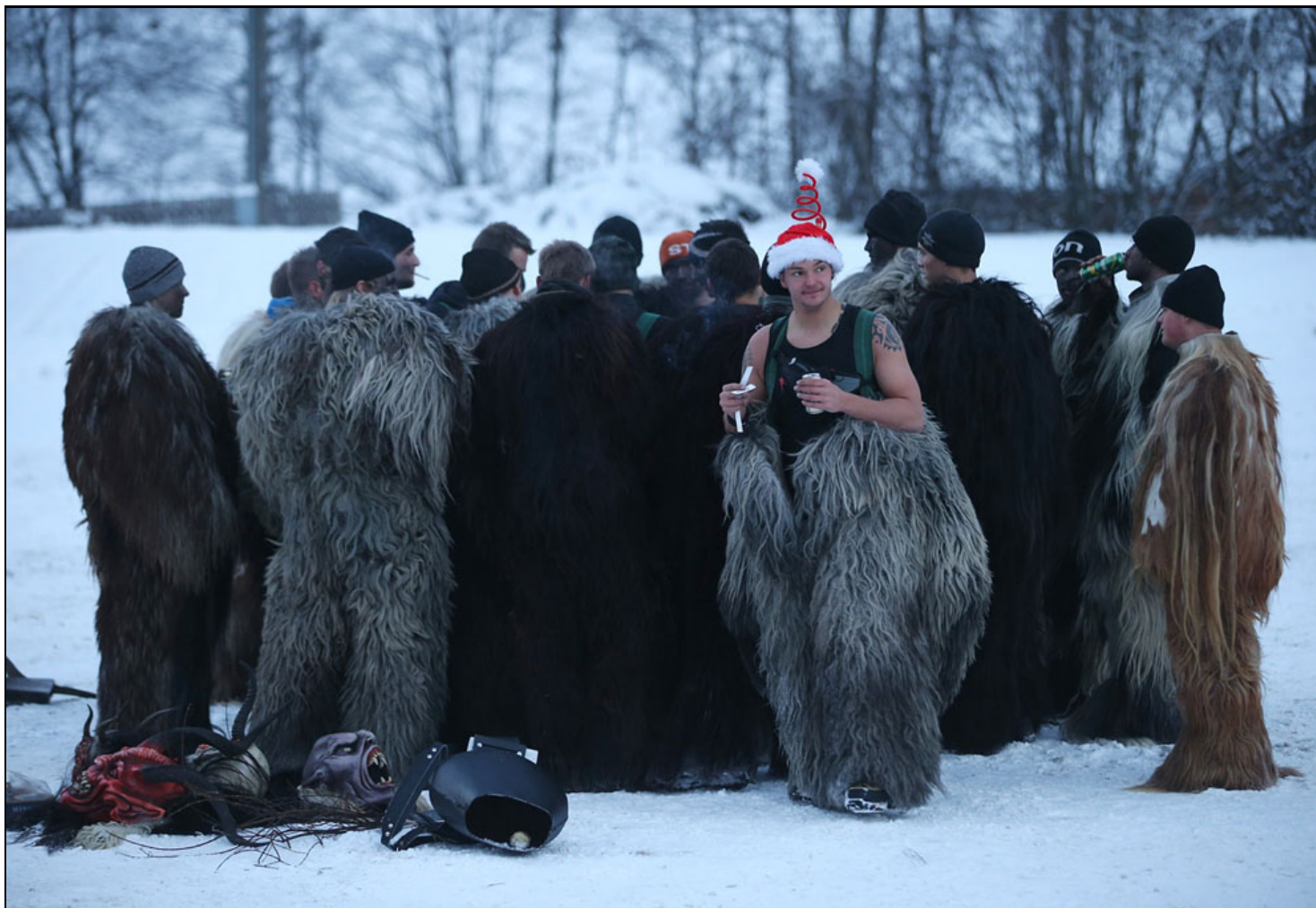
4 Participants who arrived by bus gather before dressing as Krampus, prior to Krampusnacht on November 30, 2013 in Neustift im Stubaital, Austria. # 📸