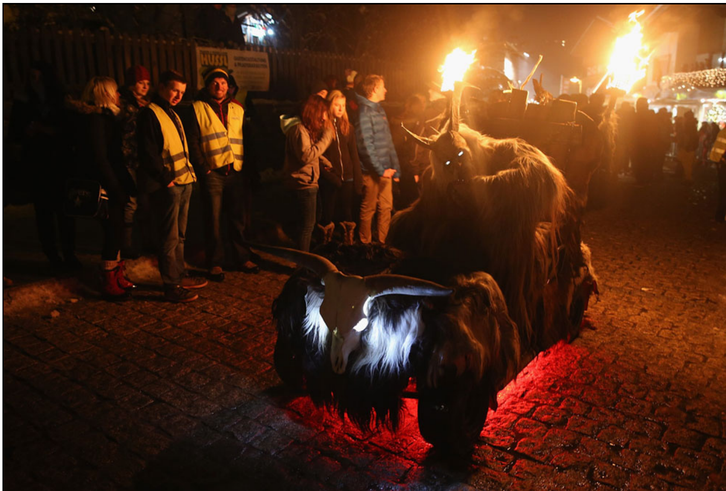
8 A participant dressed as Krampus parades past onlookers on his Krampus vehicle on November 30, 2013 in Neustift im Stubaital, Austria. # 📷