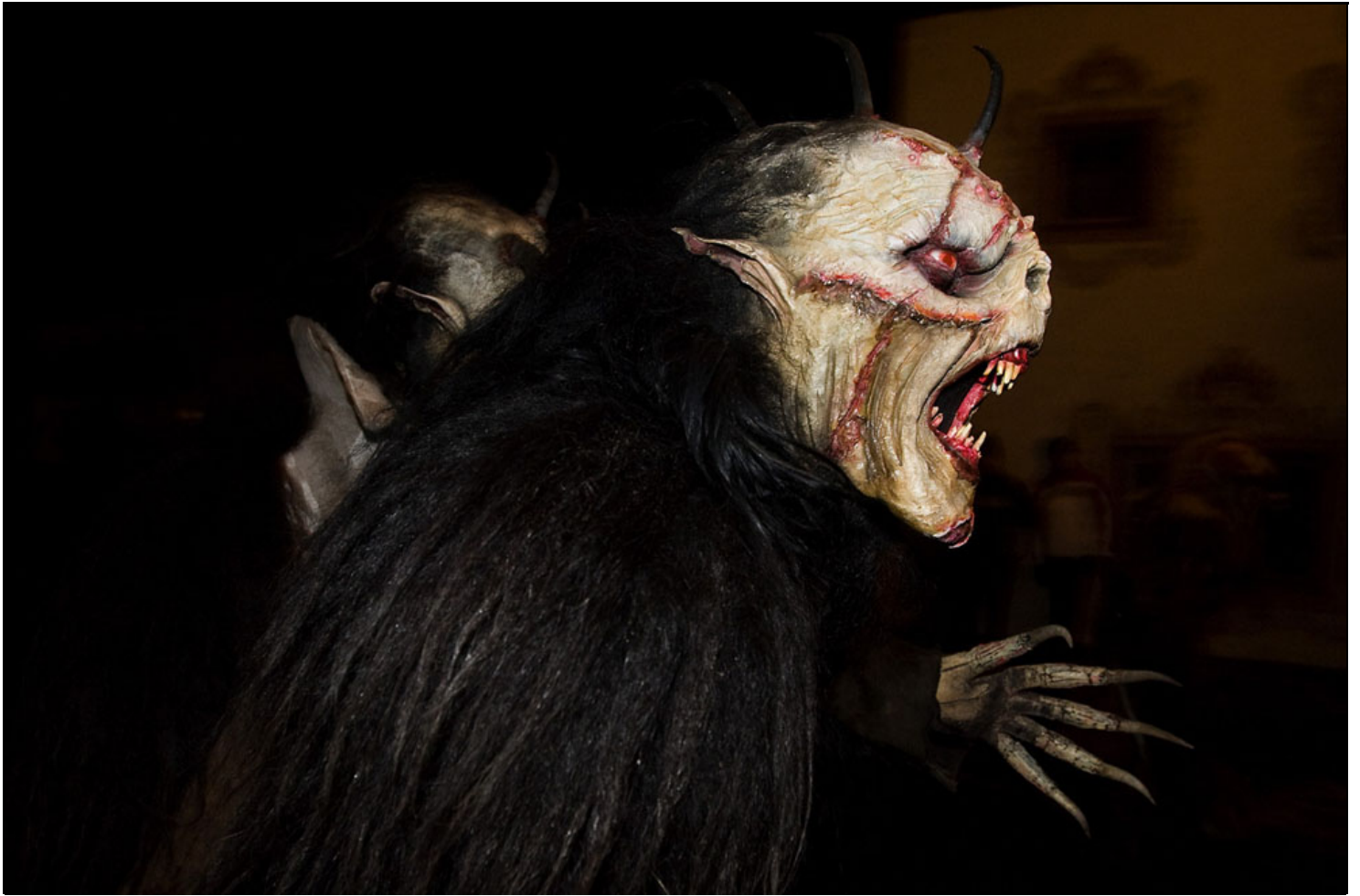
17 A man dressed as Krampus, during a traditional Krampus procession in St. Martin near Lofer in Salzburg province, Austria, on December 5, 2009. # 📸