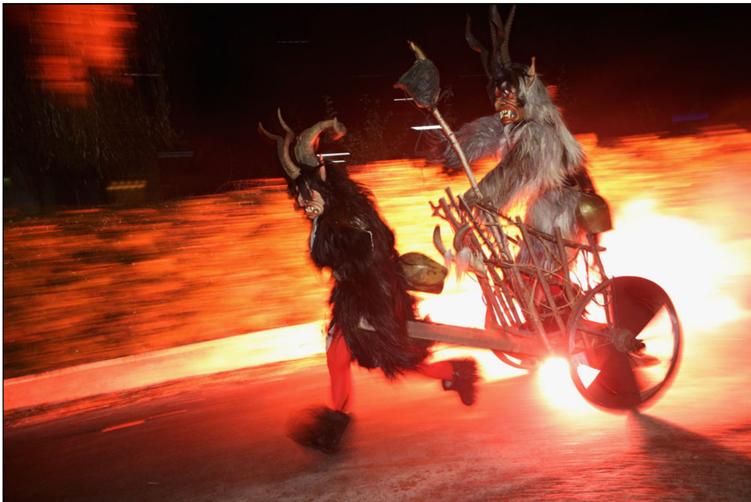
13 A members of the Haiminger Krampusgruppe pulls another on a fiery cart to the town square during the annual Krampusnacht in Haiming, Austria, on December 1, 2013. # 📸