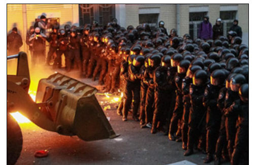
Days of Protest in Ukraine

In Focus is updated with new photo stories nearly every day, check out the Archives .