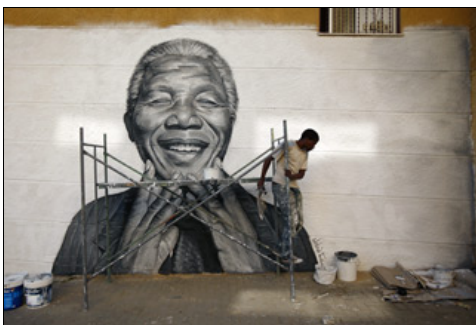
Nelson Mandela 1918-2013