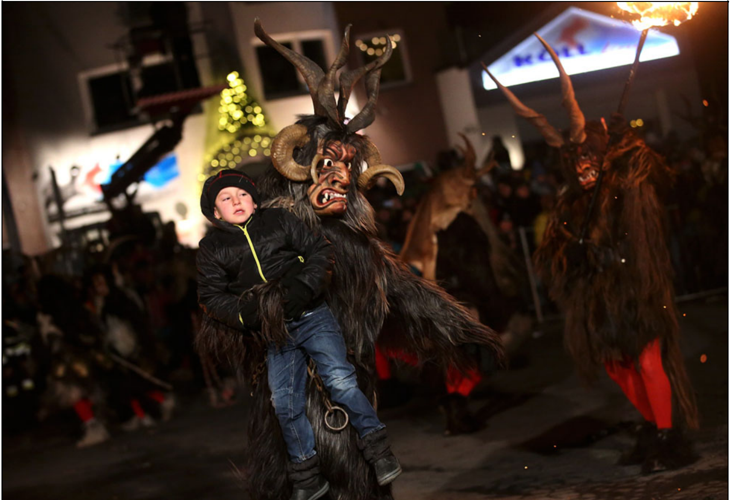
2 A member of the Haiminger Krampusgruppe dressed as the Krampus creature carries a delinquent little boy whom the Krampus will now take to Hell to transform him into the demon-like Krampus on the town square during their annual Krampusnacht in Tyrol, on December 1, 2013 in Haiming, Austria. (Sean Gallup/Getty Images) #

angels on the evening of December 5 to visit households to reward children that have been good while reprimanding those who have not. (Sean Gallup/Getty Images) #