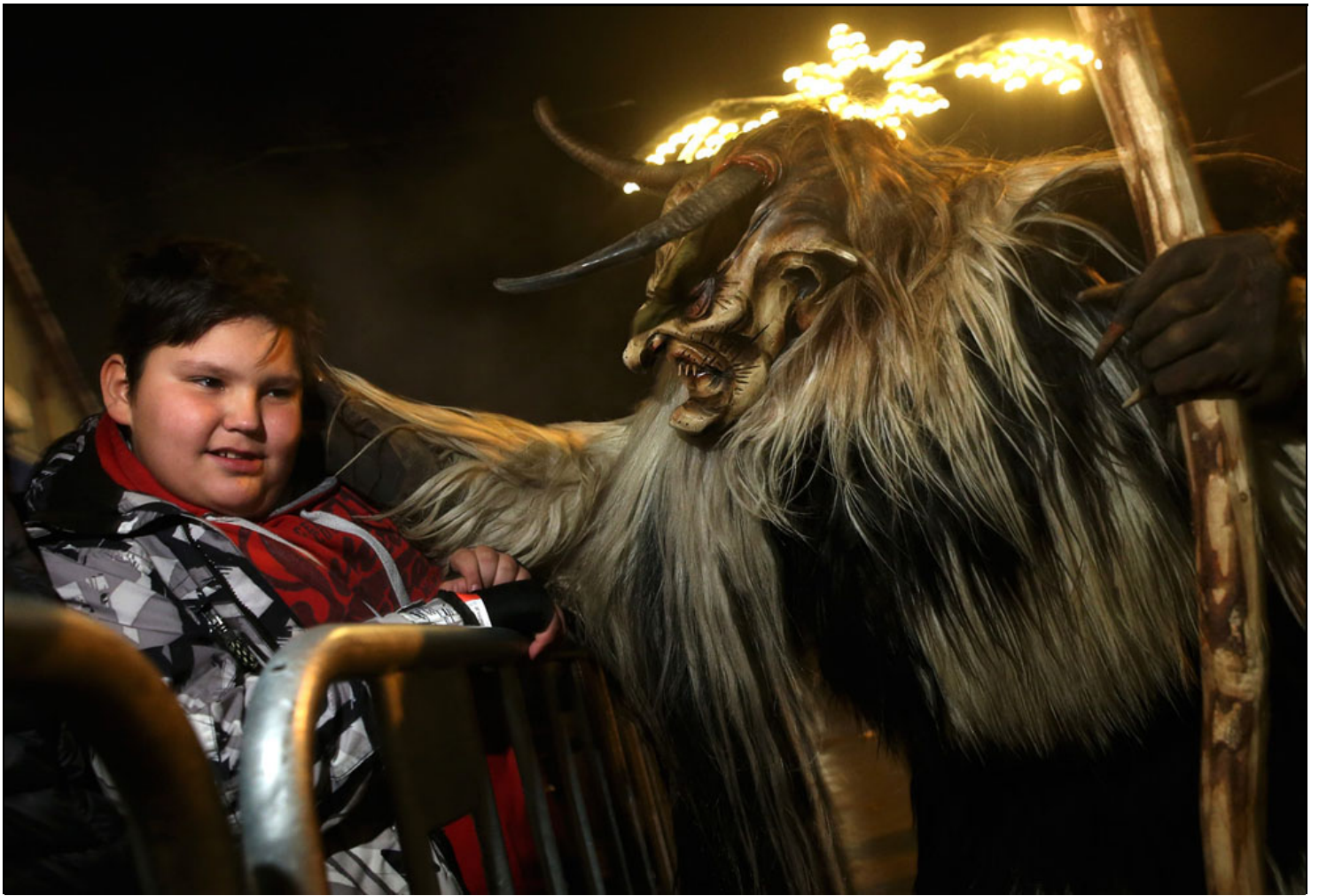
19 Krampus, in search of delinquent children, approaches a little boy during Krampusnacht in Neustift im Stubaital, Austria, on November 30, 2013. # 📸