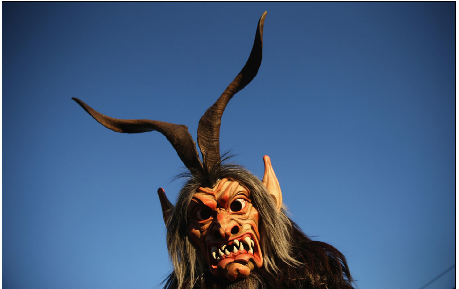
11 A Krampus creature, prior to the annual Krampusnacht in Tyrol on December 1, 2013. # 📷