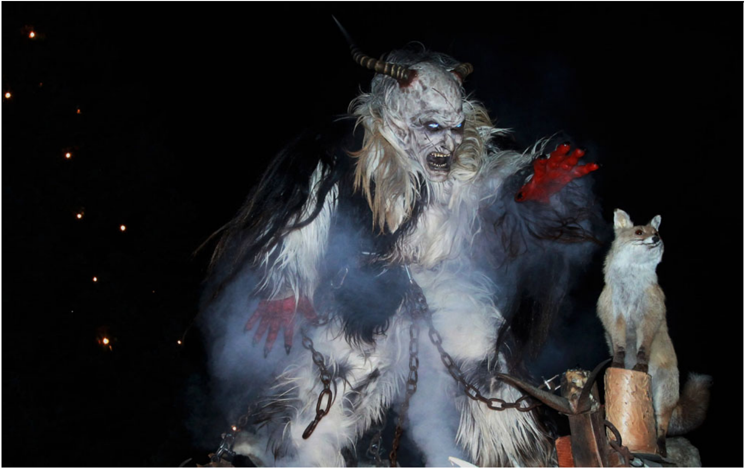
12 Members of the Koatlacker devil's association, dressed as demonic creatures take part in a Krampus procession on December 4, 2011 in Prad near Merano, Italy. # 📸