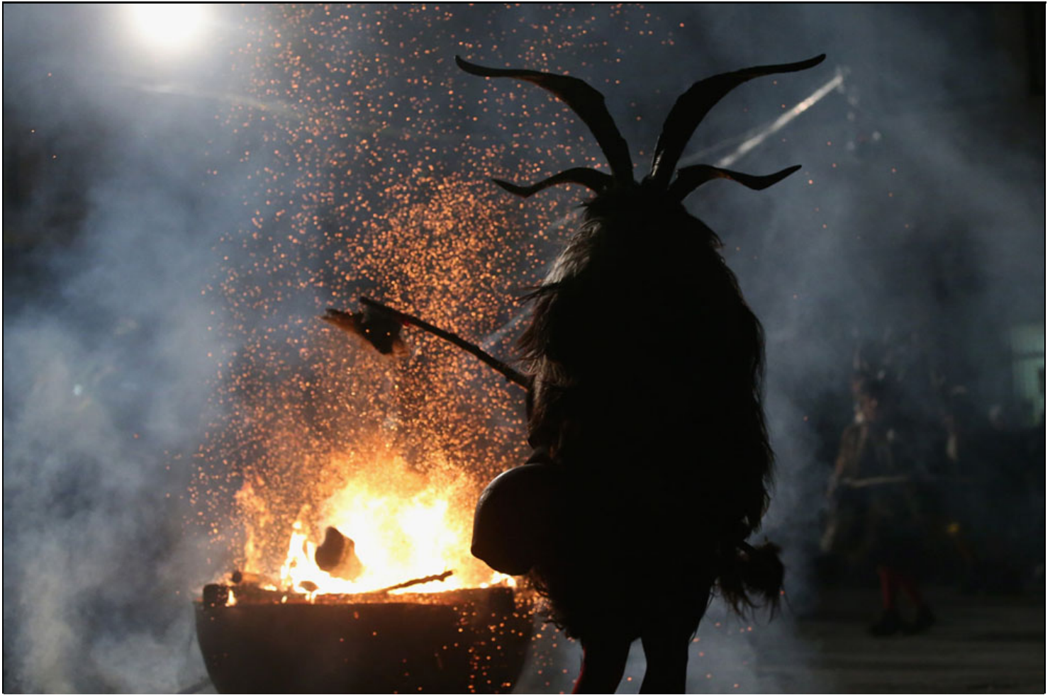
9 A member of the Haiminger Krampusgruppe dressed as Krampus hits a fire to release sparks on the town square during their annual Krampusnacht in Tyrol, on December 1, 2013. # 📸