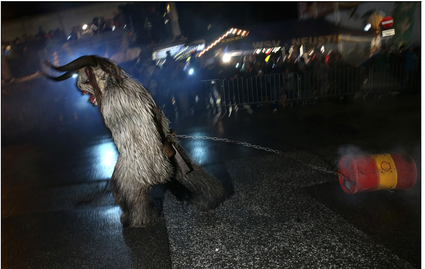
15 A participant dressed as Krampus pulls a barrel of fire past onlookers during his search for delinquent children on Krampusnacht, November 30, 2013 in Neustift im Stubaital, Austria. (Sean Gallup/Getty Images) # 📸