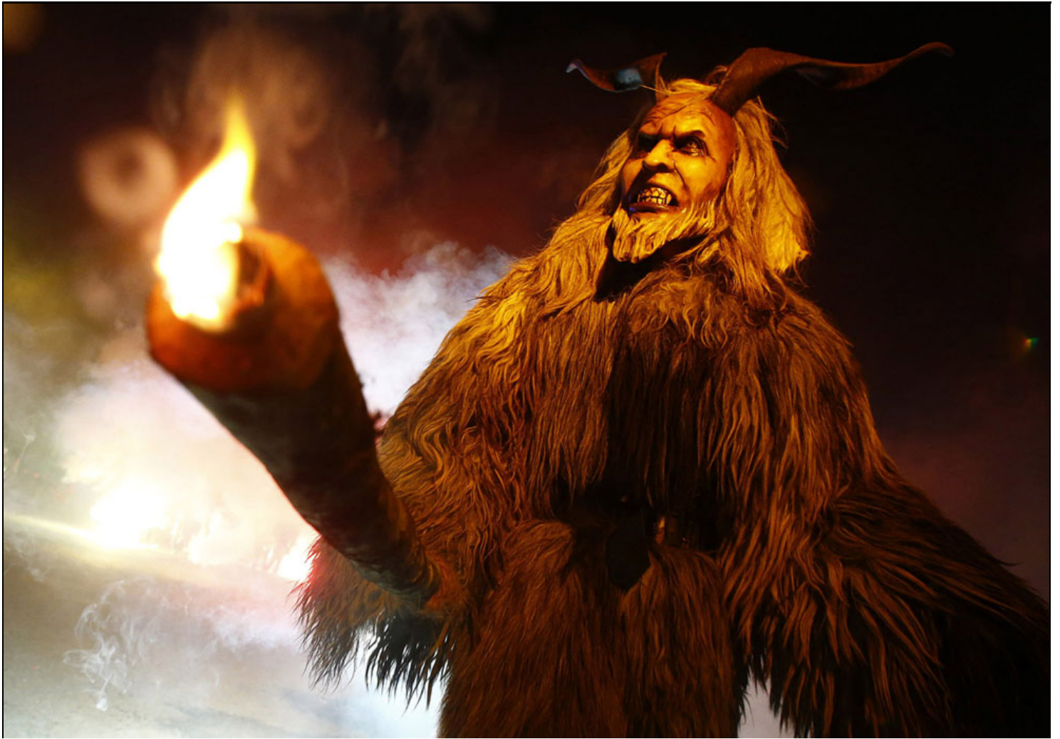
16 A man dressed in traditional Perchten (also known in some regions as Krampus or Tuifl) costume and mask performs during a Perchten festival in the western Austrian village of Heitwerwang, some 90 km (56 miles) west of Innsbruck, on November 23, 2012. # 📷