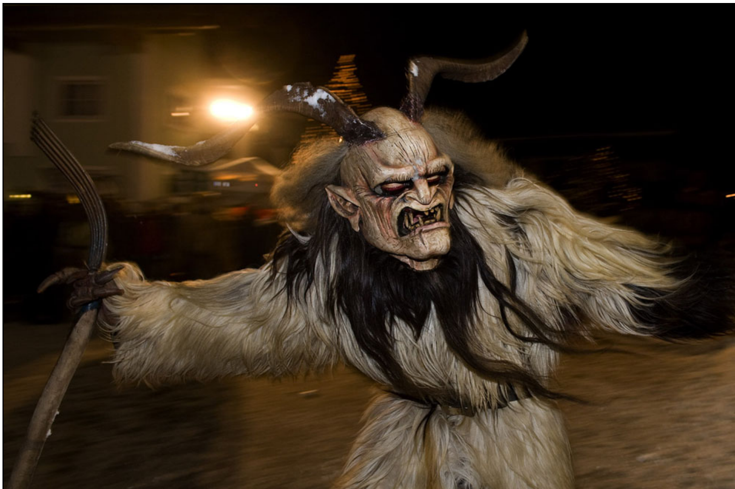
6 A man dressed as Krampus, the companion of St. Nicholas and one of Austria's unique Advent traditions, makes his way during a traditional Krampus procession in Unken, Austrian province of Salzburg, on December 5, 2010. # 📷