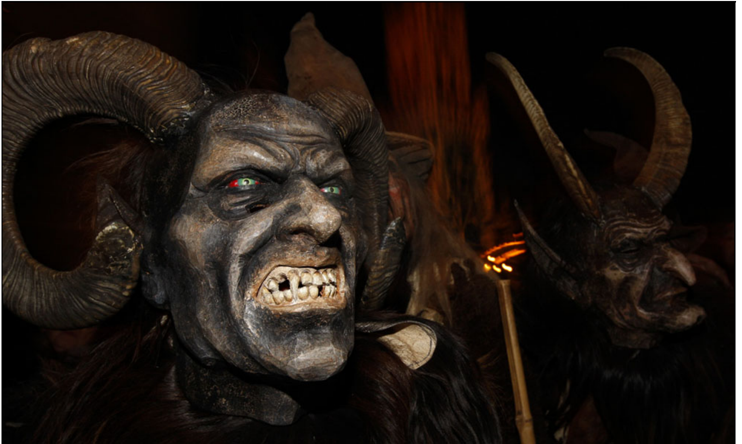
14 Men dressed as Krampus, during a traditional Krampus procession in the city of Munich, Germany, on December 7, 2008. # 📷