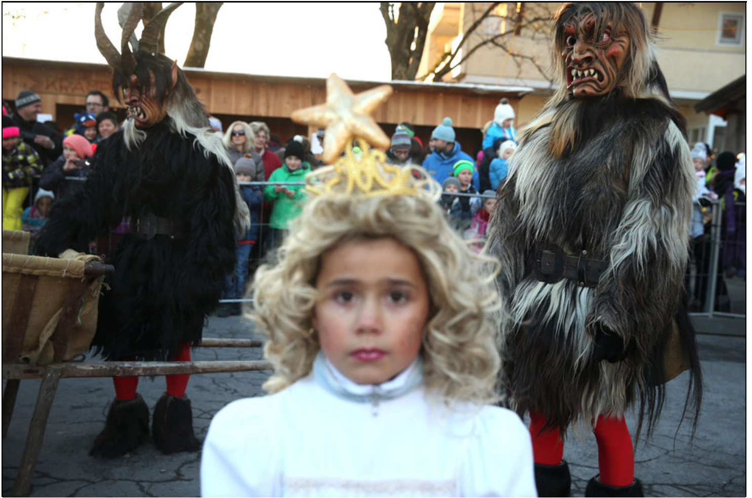
10 Members of the Haiminger Krampusgruppe watch as little girls dressed as angels distribute sweets prior to the annual Krampusnacht in Haiming, Austria, on December 1, 2013. # 📸